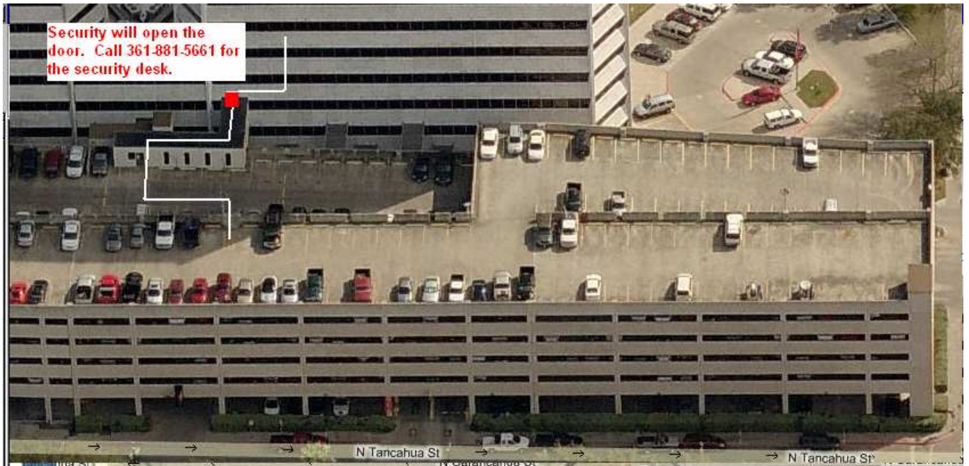
Figure 2 – Enter Building from 6 th Floor Parking Spot